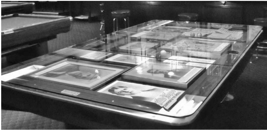
Exhibit At Billiard Club

The Illinois Billiard Club, 8442-46 S. Archer road, Willow Springs will conduct an exhibit to commemorate the 146th anniversary of Chicago professional baseball, the 152nd anniversary of American billiards and sports cartoonists through Aug. 28th.