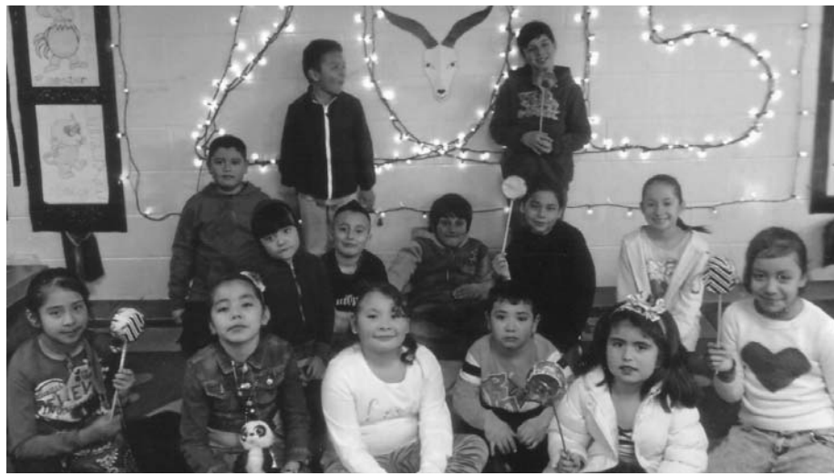
The children at Kiddy Kare Pre-School, 4444 S. Kedzie, observed the New Year with a craft project to make hats and decorations. Open enrollment for age 13 months to 10 years is available. Parents may call (773) 376-5622 to arrange a tour of the facility.