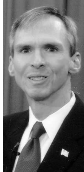
By Dan Lipinski (IL-3)

"I've always said that American manufacturers are the best and most innovative globally, but they can't compete if we keep ramming through free trade agreements with countries that aren't